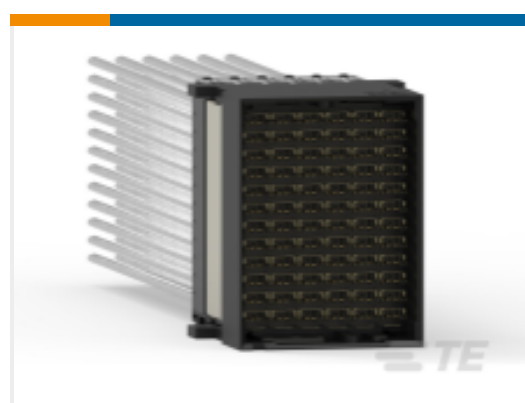
TE Part # 6-2320907-6 C/A,12P6C 100 OHM PIR CBL STRADA WHISPER