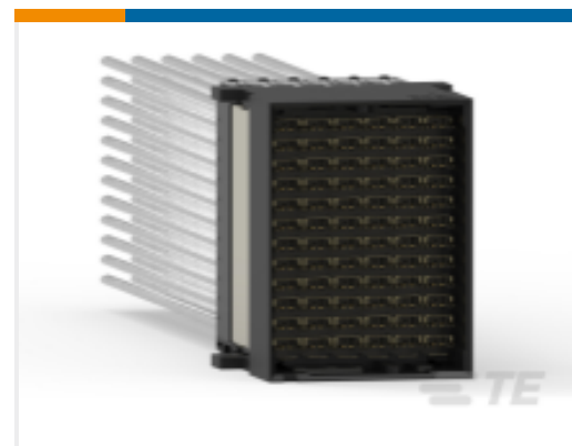
TE Part # 3-2320907-6 C/A,12P6C 100 OHM PIR CBL STRADA WHISPER