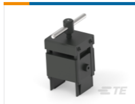
TE Part # 2185279-1 ASSY, EXTRACTION TOOL