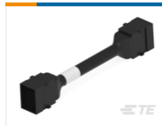
TE Part # 5-2320907-6 C/A,12P6C 100 OHM PIR CBL STRADA WHISPER