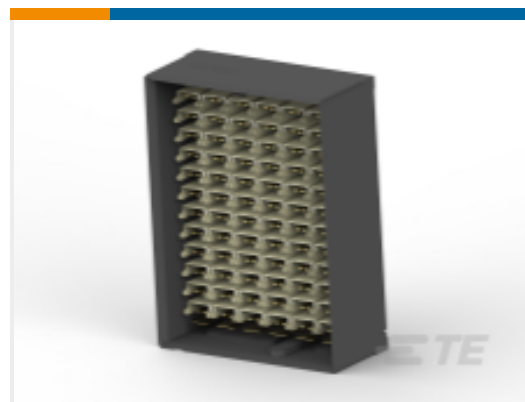
TE Part # 2187544-1 SW PIR HDR BP, 100OHM, 12X6 DEW