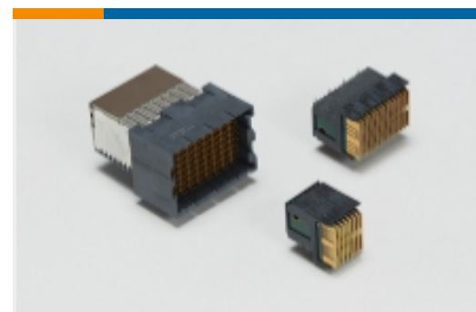
High Speed Backplane Connectors(41)