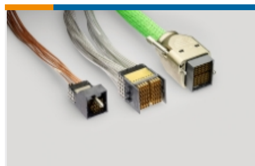
High Speed Backplane Cable Assemblies(16)