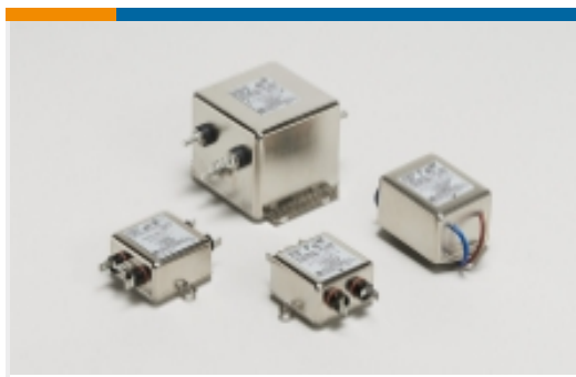
Single Phase Filters(9)