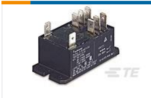
TE Part #7-1393211-1 T92P7D22-24