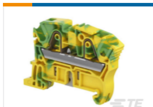
TE Part #1SNK708150R0000 ZK6-PE