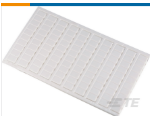
TE Part #1SNK160021R0000 MC812PA 11->20 (x10) Horizontal