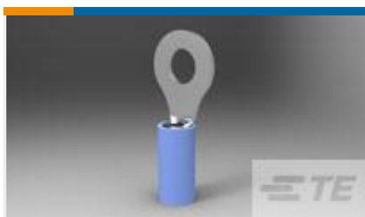
TE Part #321045 TERMINAL,PIDG R 16-14 1/4