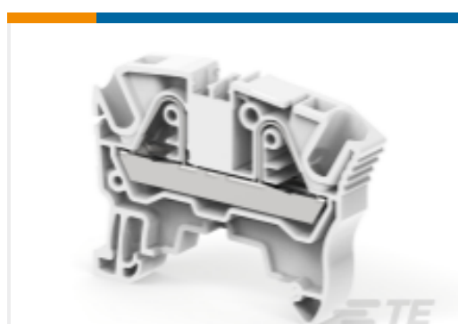
TE Part #1SNK708010R0000 ZK6