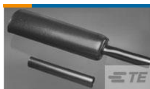
TE Part #166916-000 RMW-63/19-1200/ADH-0