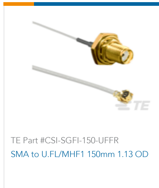
TE Part #CSI-SGFI-150-UFFR SMA to U.FL/MHF1 150mm 1.13 OD