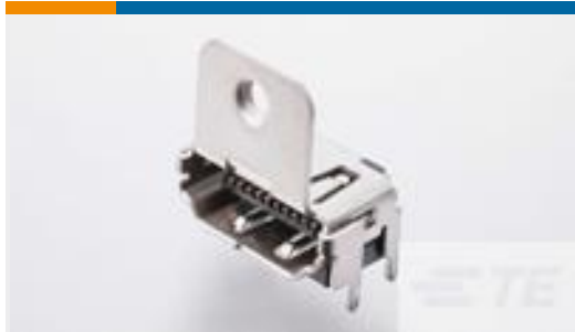
TE Part #2013978-1 Mini HDMI, RA, SMT