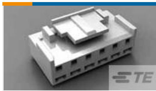
TE Part #1-1123722-7 3.96 EP PLUG HSG 7P(NATURAL)