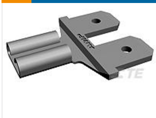
TE Part #63699-1 ADAPTER 187 FASTON TPBR