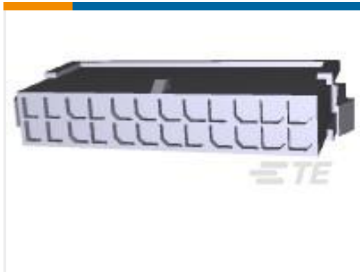
TE Part #2-794615-4 PANEL MT DBL ROW HSG 24 POS