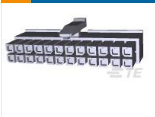
TE Part #2-794617-4 24POS,MICRO MNL,RCPT HSG