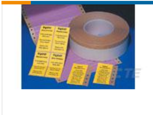
TE Part #160892-000 TTVF100WE-100