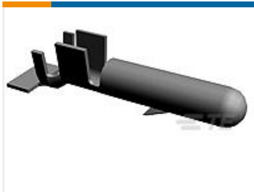
TE Part #61234-1 .156 MNL PIN 12-10 PTPBR