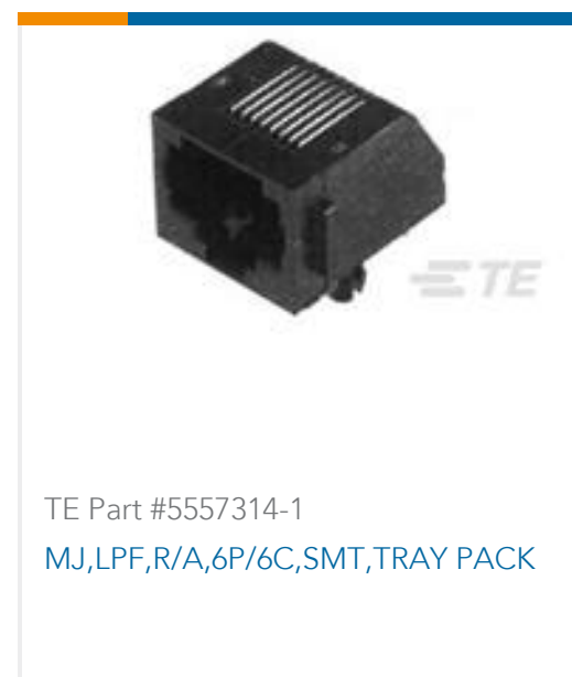
TE Part #5557314-1 MJ,LPF,R/A,6P/6C,SMT,TRAY PACK