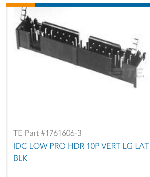
TE Part #1761606-3 IDC LOW PRO HDR 10P VERT LG LAT BLK