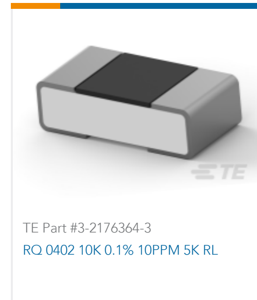
TE Part #3-2176364-3 RQ 0402 10K 0.1% 10PPM 5K RL