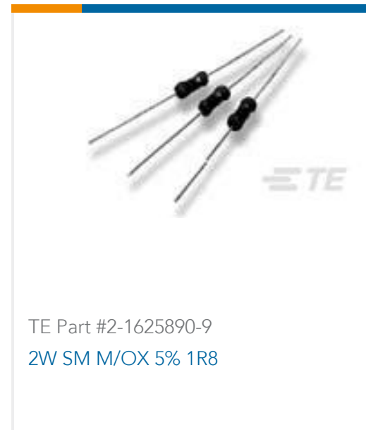
TE Part #2-1625890-9 2W SM M/OX 5% 1R8