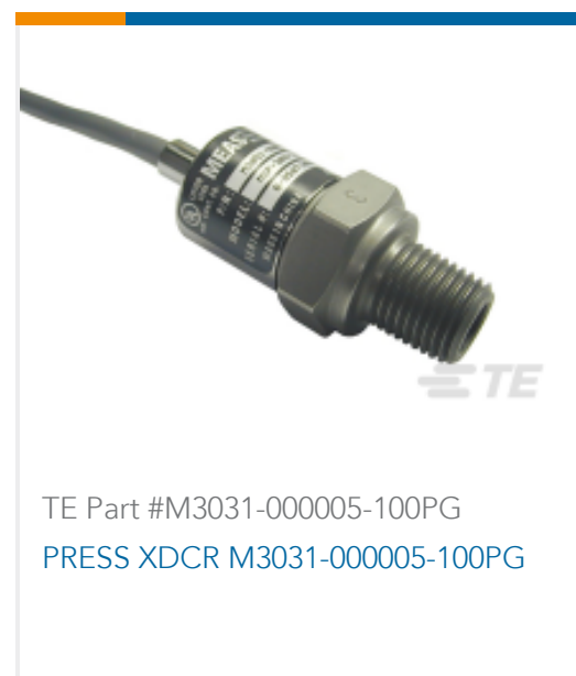
TE Part #M3031-000005-100PG PRESS XDCR M3031-000005-100PG