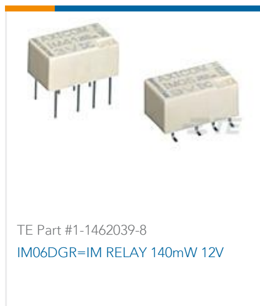
TE Part #1-1462039-8 IM06DGR=IM RELAY 140mW 12V