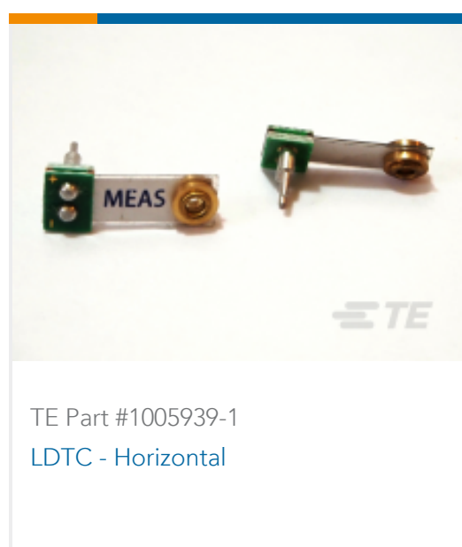
TE Part #1005939-1 LDTC - Horizontal