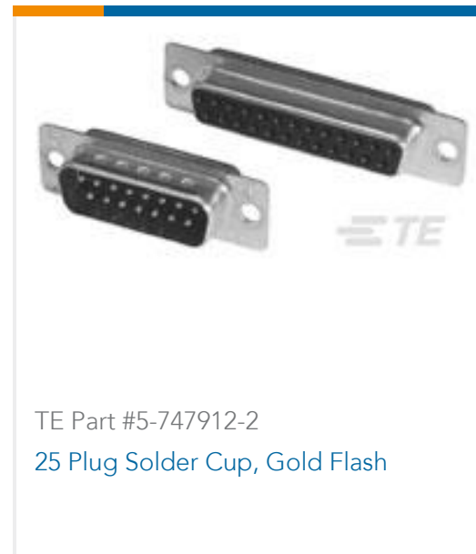
TE Part #5-747912-2 25 Plug Solder Cup, Gold Flash