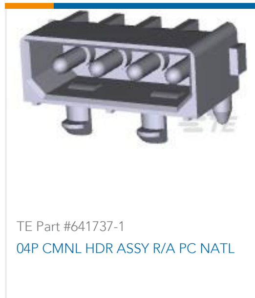
TE Part #641737-1 04P CMNL HDR ASSY R/A PC NATL