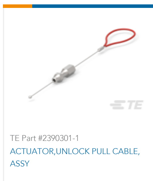
TE Part #2390301-1 ACTUATOR,UNLOCK PULL CABLE, ASSY