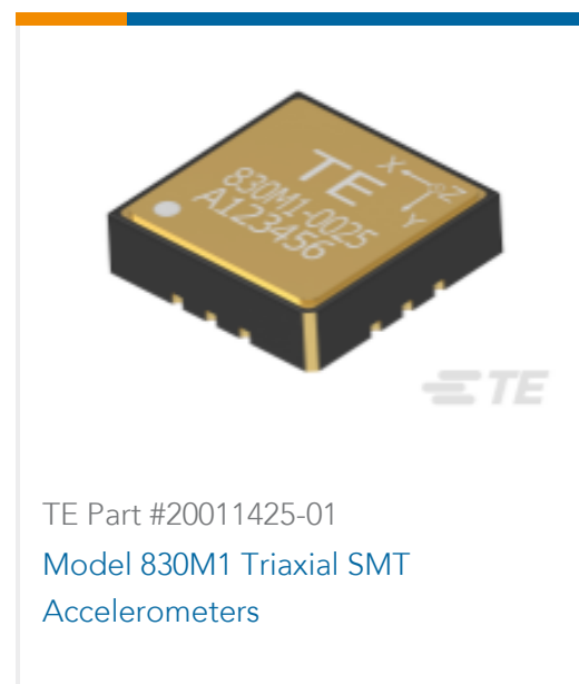
TE Part #20011425-01 Model 830M1 Triaxial SMT Accelerometers