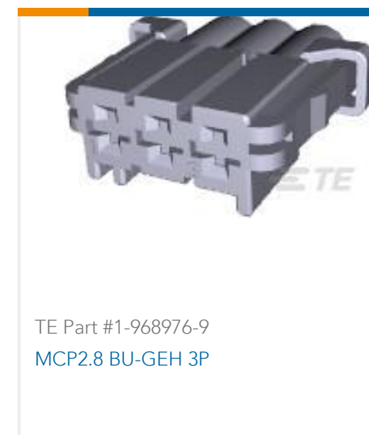
TE Part #1-968976-9 MCP2.8 BU-GEH 3P