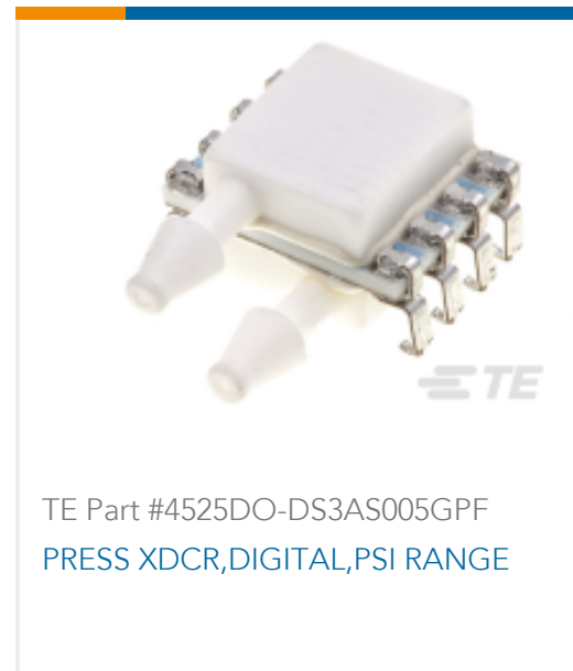
TE Part #4525DO-DS3AS005GPF PRESS XDCR,DIGITAL,PSI RANGE