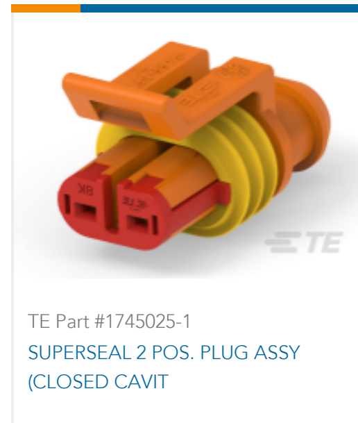
TE Part #1745025-1 SUPERSEAL 2 POS. PLUG ASSY (CLOSED CAVIT)