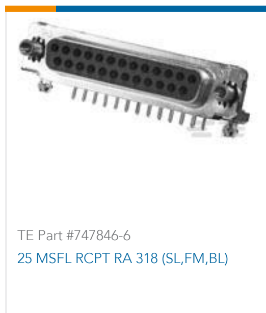
TE Part #747846-6 25 MSFL RCPT RA 318 (SL,FM,BL)