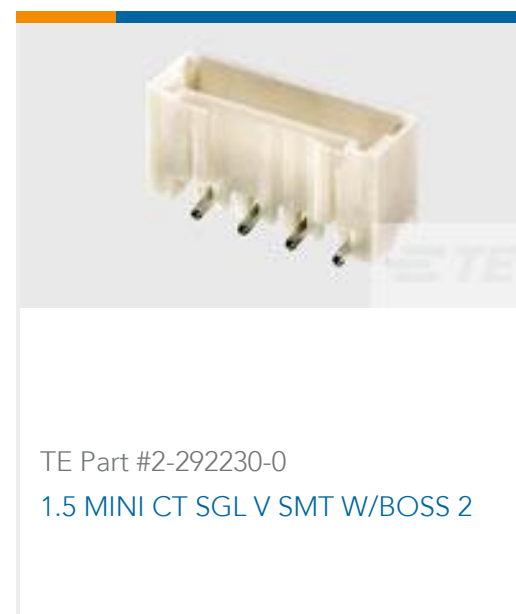
TE Part #2-292230-0 1.5 MINI CT SGL V SMT W/BOSS 2