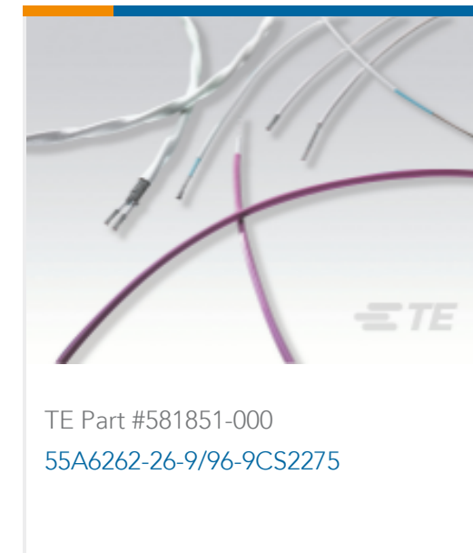
TE Part #581851-000 55A6262-26-9/96-9CS2275