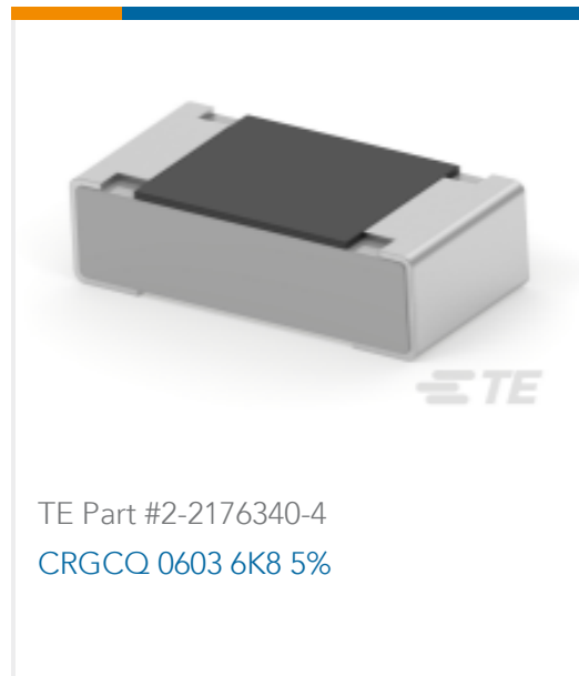
TE Part #2-2176340-4 CRGCQ 0603 6K8 5%