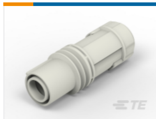
TE Part # T2193503201-000 HCM350-FC