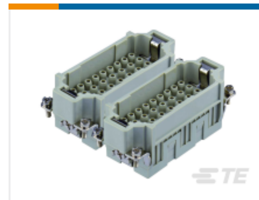
TE Part # T2051283101-000 HEEE-064-M 65-128