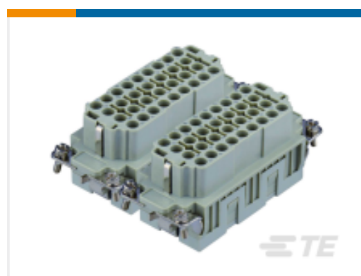
TE Part # T2051283201-000 HEEE-064-F 65-128