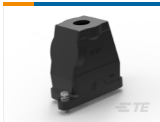
TE Part # T1920060125-009 H6BPR-TGH-M25-EMC-C