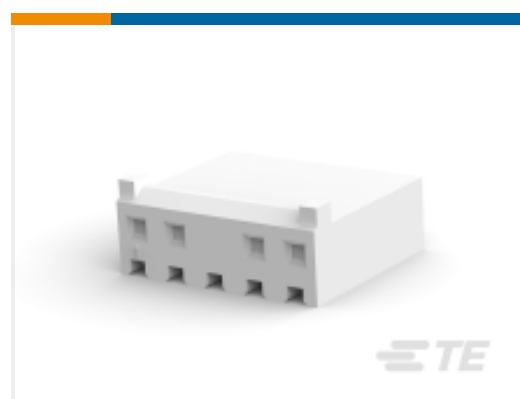
TE Part # 647344-5 05P SL156 HSG W/RP TB BLK #3