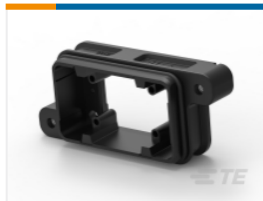
TE Part # T1930060000-009 H6BPR-AG-EMC-C