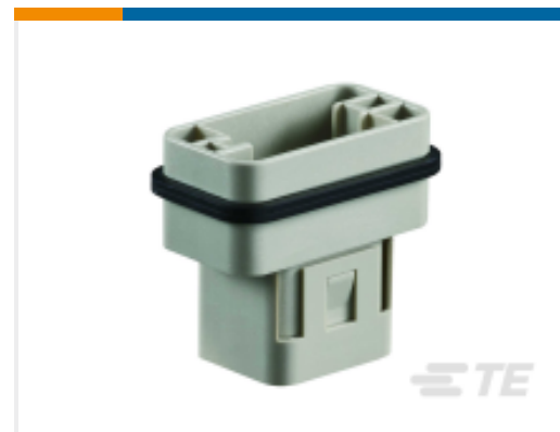
TE Part # T2019092101-000 HQ-008-M