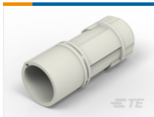
TE Part # T2193503101-000 HCM350-MC