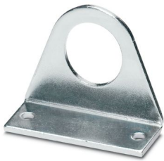
Fixing bracket for protective sleeves, fixed with two screws

https://www.phoenixcontact.com/us/products/3241080