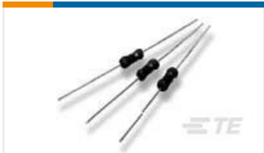
TE Part #2-1625890-9 2W SM M/OX 5% 1R8