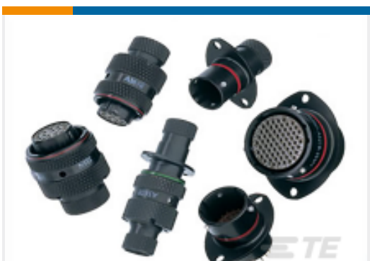
TE Part #AS612-98SN PLUG BOOT TERMIN'N TYPE 6