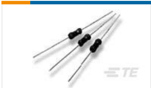
TE Part #8-1625890-1 2W SM M/OX 5% 3R3