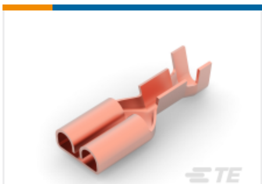
TE Part #969184-1 AMVAR FF 250 REC DIA 0.9-1.6 PB