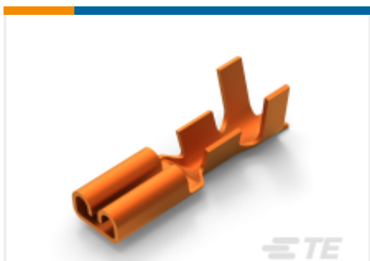
TE Part #1494219-1 110 FASTON,REC.,18-22 AWG,BR