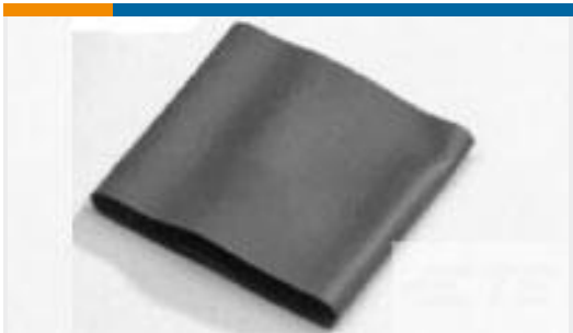
TE Part #137963J001 V2-1.5-0-SP-SM