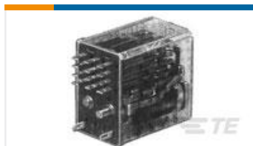
TE Part #1-1393766-9 R10-E1X4-24V=R10