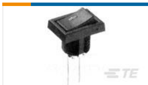
TE Part #5-1437595-2 TRD11F10WL=SUB MINI ROCKER BLA