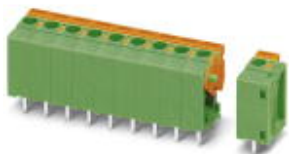
The illustration shows the 10-position version

PCB terminal block, Nominal current: 15 A, Nom. voltage: 320 V, Pitch: 5.08 mm, Number of positions: 5, Connection method: Spring-cage connection, Mounting: Soldering, Conductor/PCB connection direction: 90 °, Color: green