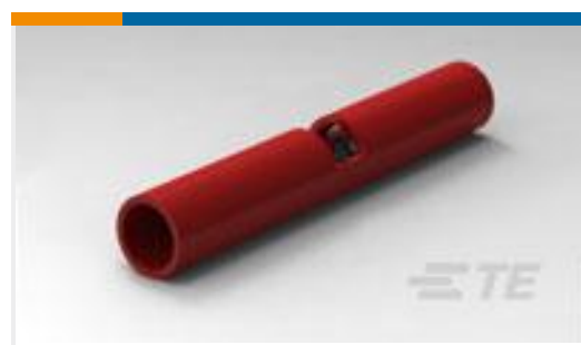
TE Part #2-320559-4 SPLICE BUTT PIDG 22-16; TAPE