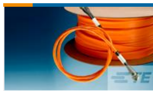
TE Part #CP2527-000 RT-780-3/8-3-SP