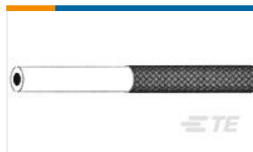
TE Part #A427053001 RAY-90-12.5(100)