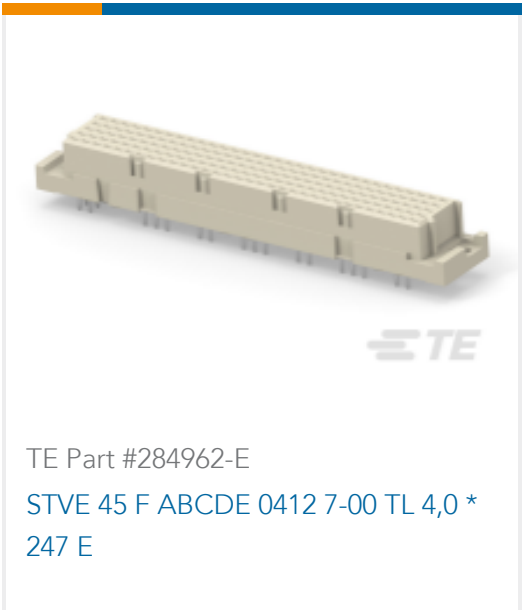
TE Part #284962-E STVE 45 F ABCDE 0412 7-00 TL 4,0 * 247 E