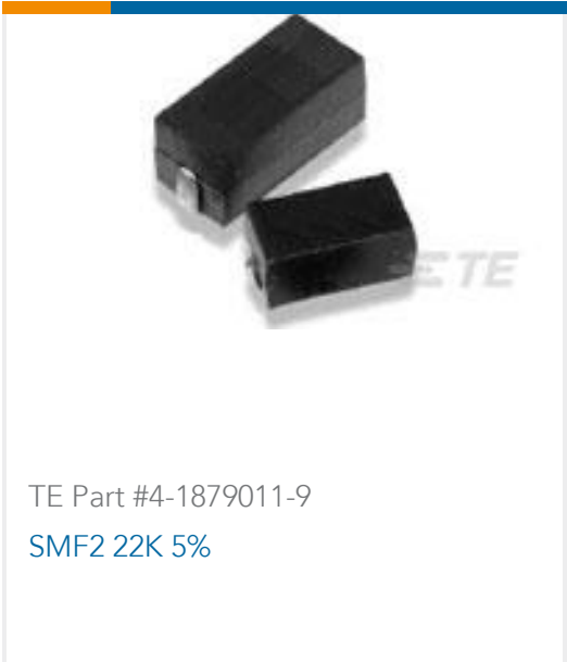
TE Part #4-1879011-9 SMF2 22K 5%