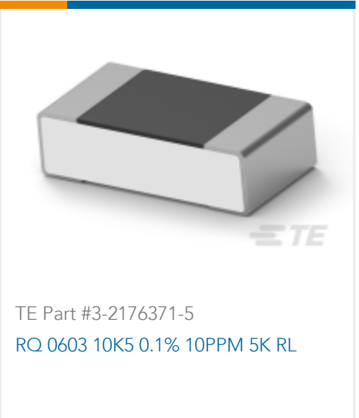
TE Part #3-2176371-5 RQ 0603 10K5 0.1% 10PPM 5K RL