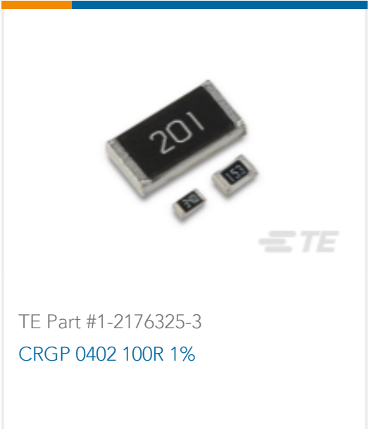
TE Part #1-2176325-3 CRGP 0402 100R 1%