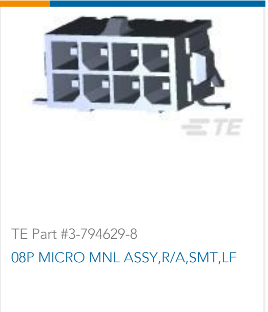
TE Part #3-794629-8 08P MICRO MNL ASSY,R/A,SMT,LF