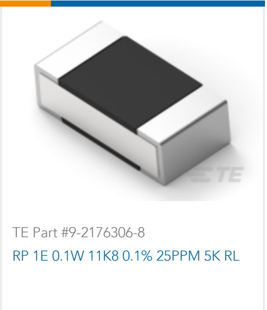
TE Part #9-2176306-8 RP 1E 0.1W 11K8 0.1% 25PPM 5K RL