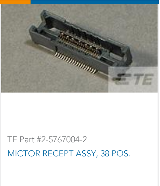
TE Part #2-5767004-2 MICTOR RECEPT ASSY, 38 POS.