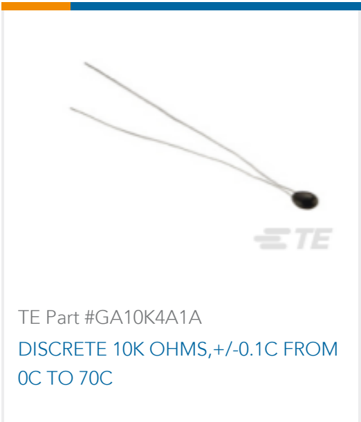
TE Part #GA10K4A1A DISCRETE 10K OHMS,+/-0.1C FROM 0C TO 70C