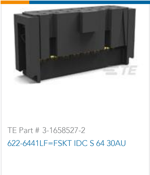
TE Part # 3-1658527-2 622-6441LF=FSKT IDC S 64 30AU