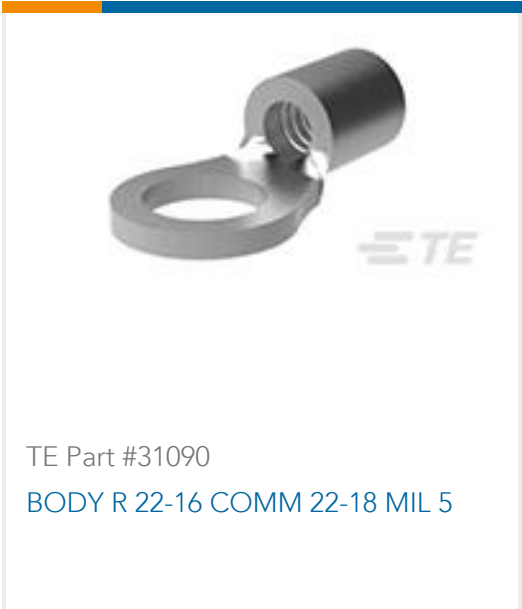
TE Part #31090 BODY R 22-16 COMM 22-18 MIL 5