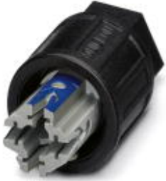
QUICKON set for replacement purposes, consisting of splice ring, pressure nut and line seal

Please be informed that the data shown in this PDF Document is generated from our Online Catalog. Please find the complete data in the user's documentation. Our General Terms of Use for Downloads are valid ( http://phoenixcontact.com/download )