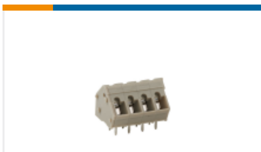
TE Part #2834076-1 5.0MM TOP ENTRY MSC 2P_GY