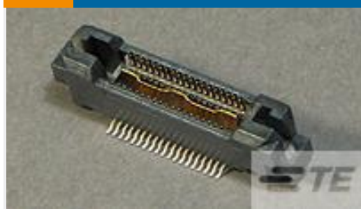
TE Part #5767007-8 MICT,260PLUG,38,ASSY,.025,REC