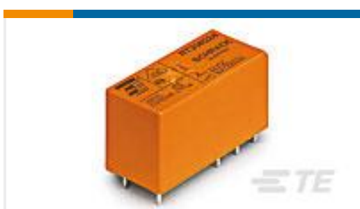
TE Part #3-1649329-1 RT444012