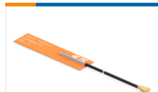
TE Part #2344657-1 FPC ANTENNA, CABLE, MHF, Wi-Fi TRIPLE