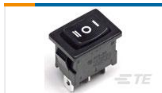
TE Part #1571083-2 PRASC1-16F-BBR00=POWER ROCKER