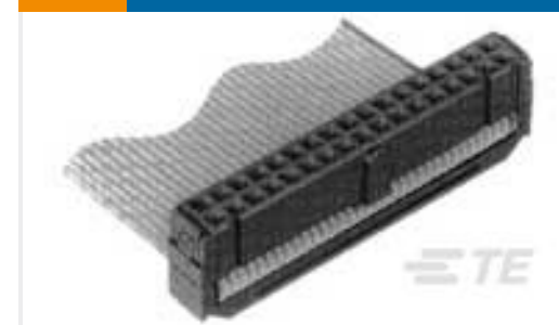
TE Part #1658622-1 10 NOVO MIL/CTR 30DP,LEAD FREE