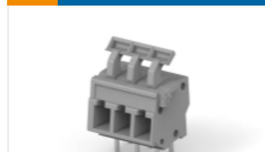
TE Part #2834082-2 5.0MM SIDE ENTRY MSC 3P_GY