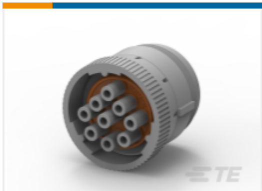
TE Part #HD16-9-96SE PLG, 9P, GRY, E, THRD, 16