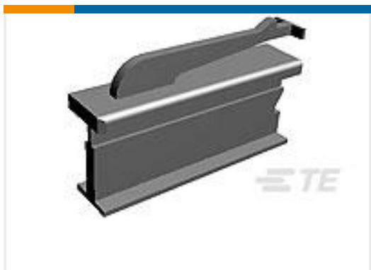
TE Part #1355528-2 MPQ 2.KONT-SICHNG8P