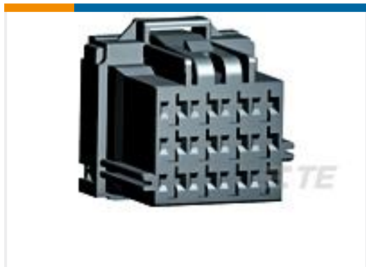
TE Part #4-968972-1 MCP2,8 GEH ASSY 12P