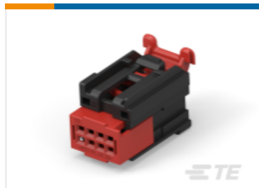
TE Part #1456987-1 2x4 Fem unsealed LP assy Key A