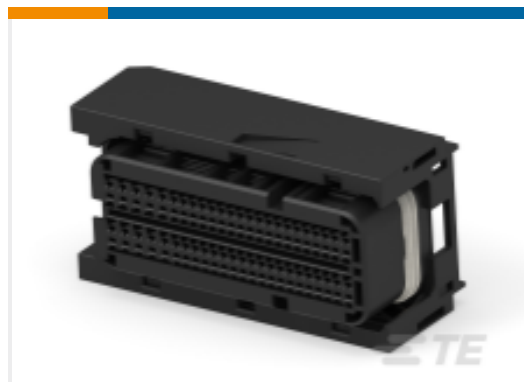
TE Part #2359943-2 96POS,MCON-1.2 CB,REC HSG,ASSY