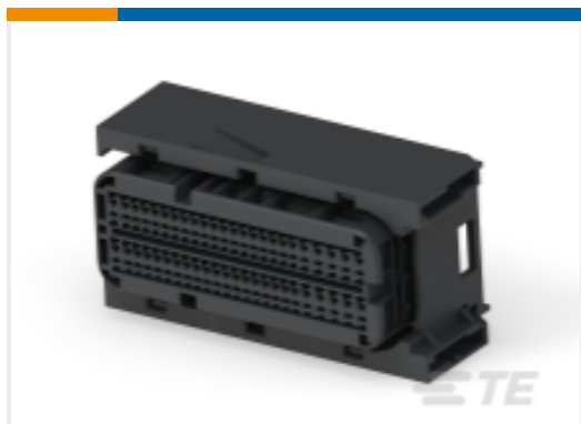
TE Part #8-1564284-5 96POS,MCON-1.2 CB,REC HSG,ASSY