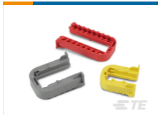
TE Part #1703838-2 Heavy Duty Sealed Connector Series Fixing Slides