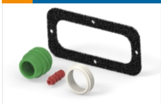
Connector Seals & Cavity Plugs(5)