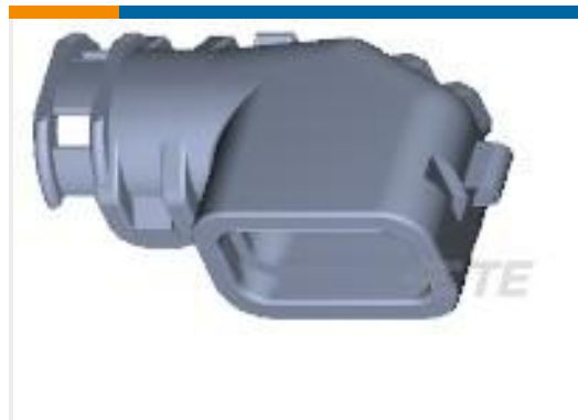
TE Part #1670150-1 COVER MIXED,90,NW8.5