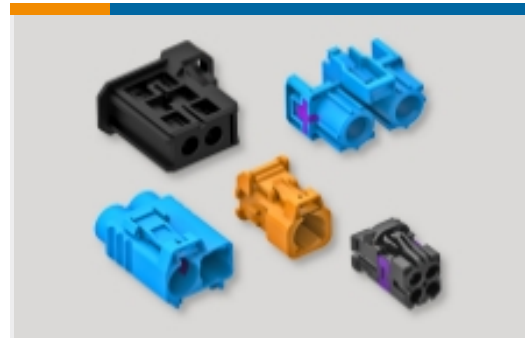
Data Connectivity Housings(16)