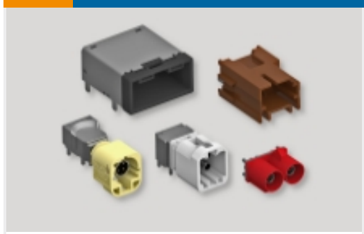
Data Connectivity Headers(2)