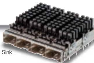
1X4 SFP+ Cage with Heat Sink U77-E462M-2081

PCB MOUNTING OPTIONS Various options available Consult sales or website for details