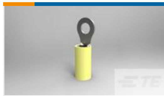
TE Part #324075 TERMINAL,PIDG R 26-22 10