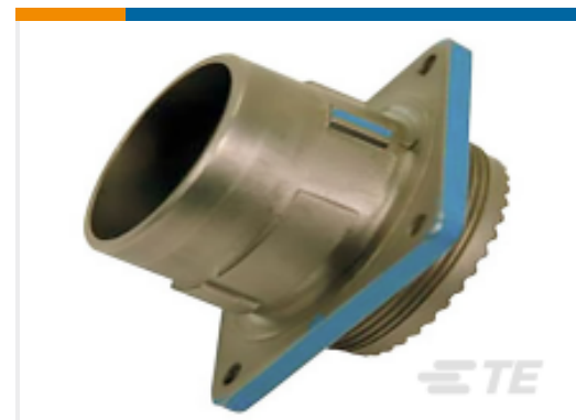
TE Part #YDIV40E11-05PBC009 RECP ASSY