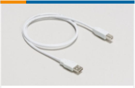
USB Cable Assemblies(1)