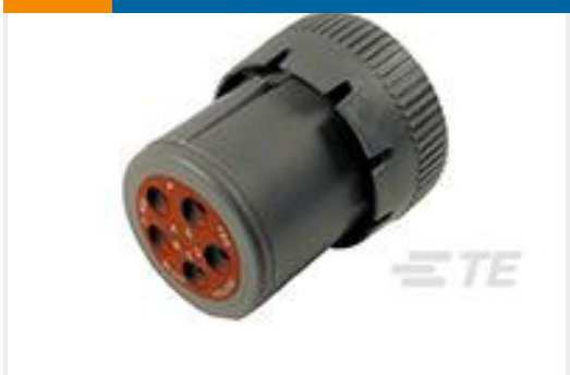
TE Part #HD16-5-16S PLG, 5P, GRY, N, 16