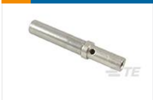
TE Part #0462-201-16141 SOC, SOLID, SIZE 16, 16-20AWG, NI