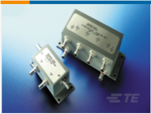
TE Part #119895-000 D-500-0255-533-3