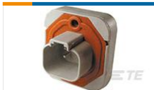
TE Part #DT15-4P HDR, 4P, GRY, ST, NI/CU