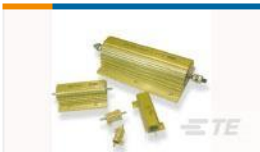
TE Part #1630012-1 HSC150 100R 5%