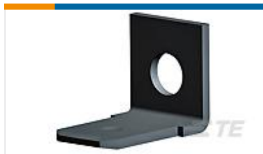
TE Part #42117-2 250 FASTON TAB TPBR