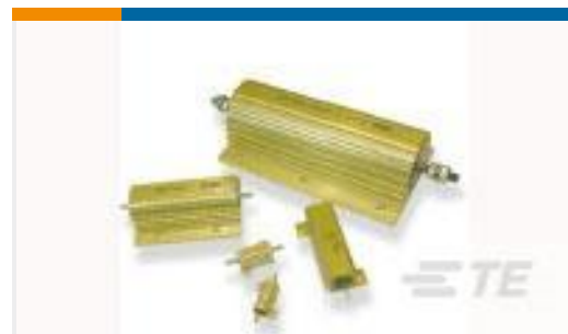
TE Part #4-1625999-0 HSC100 4R7 5%