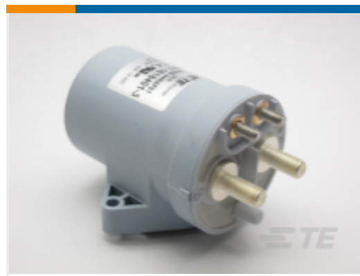
TE Part # 5-1618388-7 LEV200A6ANF=RELAY, SPST-NO