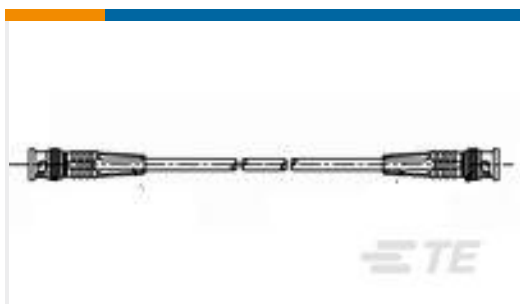
TE Part #1337775-1 75 OHM COAX BNC STR PLUG P99-E