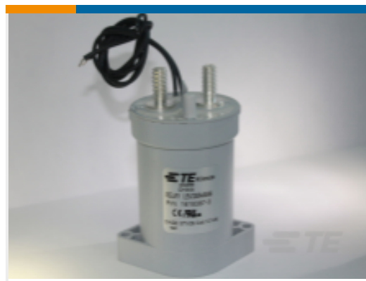
TE Part # 7-1618387-1 LEV200A5ANA=RELAY, SPST-NO