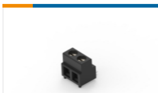
TE Part #2383938-2 TERMI-BLOK SMD MOUNT 180_2P_5 MM