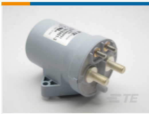
TE Part # 8-1618401-9 LEV200L5ANF=Contactor, SPST-NO w /aux