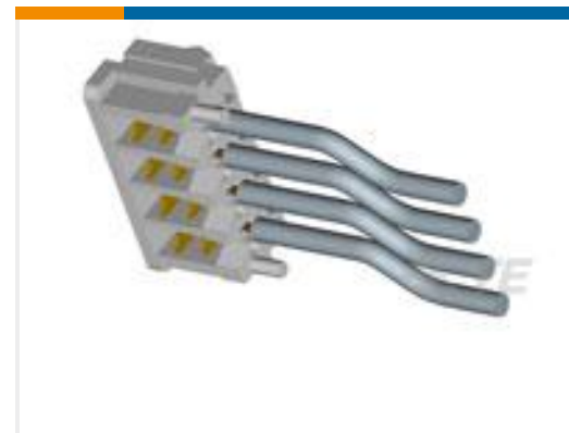
TE Part #1-173977-0 CT CONN MT REC ASSY 10P