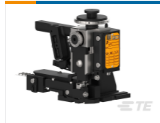
TE Part # 2266763-1 OCEAN_2.0_APPLICATOR-S-042F110F-RSM