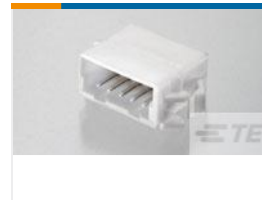
TE Part #292254-8 CT RELAY HDR ASSY 8P NAT