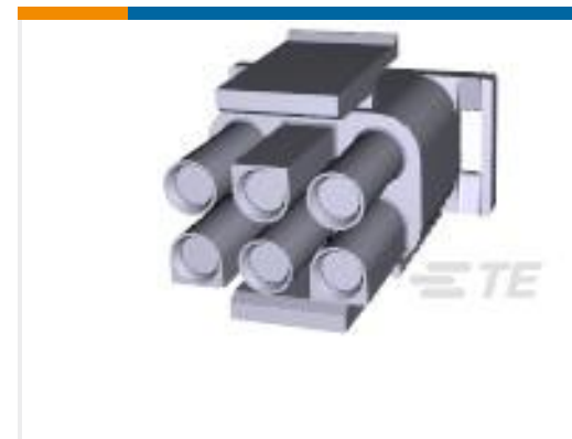
TE Part #1-1644055-2 UMNL 6 WAY PLUG HOUSING