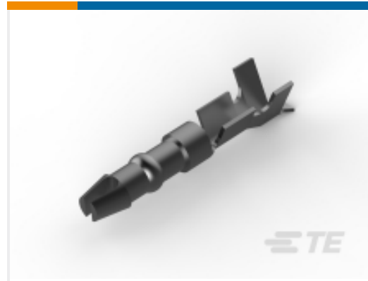
TE Part # 3-42642-3 AMP-IN TERM IS 22-20 010PTBR