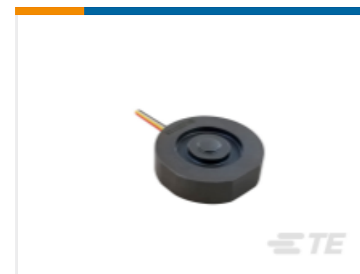
TE Part #20009605-07 FX292X-100A-0100-L