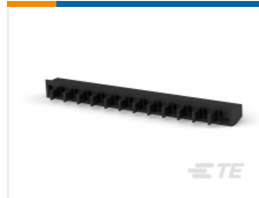
TE Part # 172020-1 13P MINI AMPIN HEADER HSG