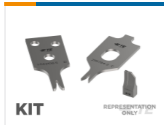
TE Part # 7-2266763-7 OCEAN_2.0_SPARE_PART_KIT-042F110F