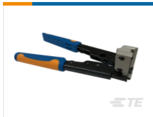
TE Part # 2305570-1 Strip Terminal Cutter-Side Feed-No Crimp