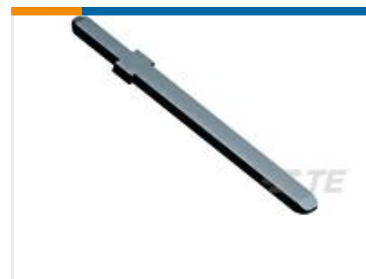
TE Part #1-1743447-2 ACTION PIN FOR 1.2mm TAB