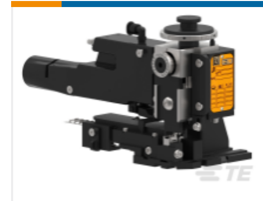
TE Part # 2266763-2 OCEAN_2.0_APPLICATOR-S-042F110F-RSA