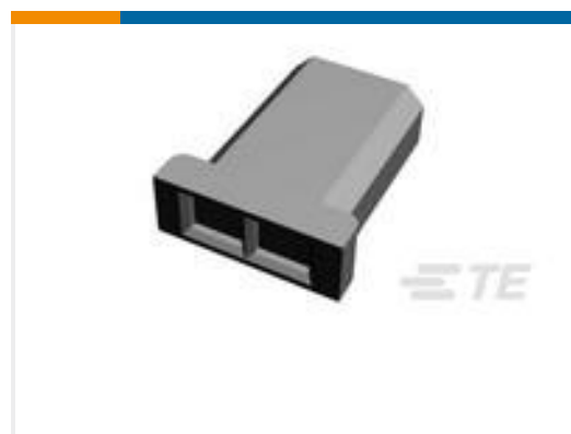
TE Part #925015 FF 110 REC HSG 3P NYLON NAT