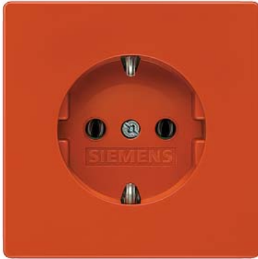
DELTA style, SCHUKO socket outlet 10/16 A 250 V Orange bezel (ZSV) cover plate 68 x 68 mm