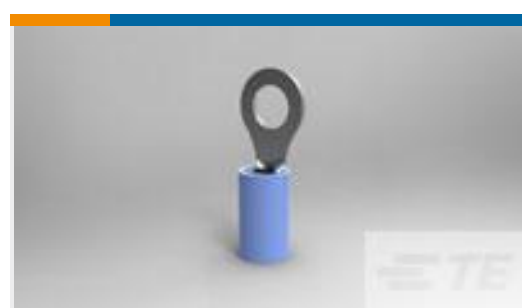
TE Part #2-36160-1 PIDG 16-14 R 10; TAPE