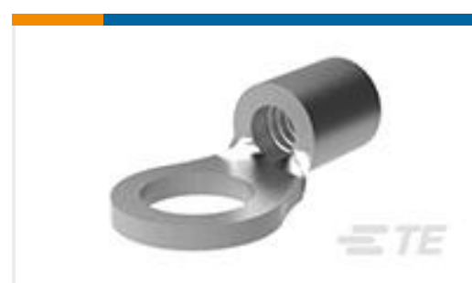
TE Part #2-33459-6 TERMINAL, SOLIS R 12-10 5/16