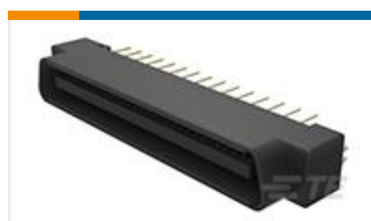
TE Part #1734100-5 Champ050 series, 50pos, Au over PdNi