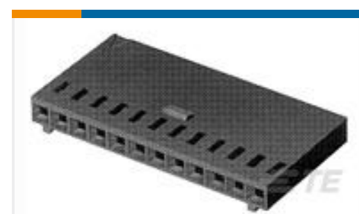
TE Part #102241-2 04 MODIV HG COMP SR .100 POL