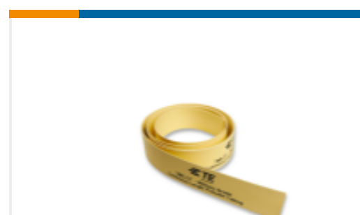
TE Part #EL7662-000 CONTINUOUS TUBE MILITARY GRADE TMS-CT