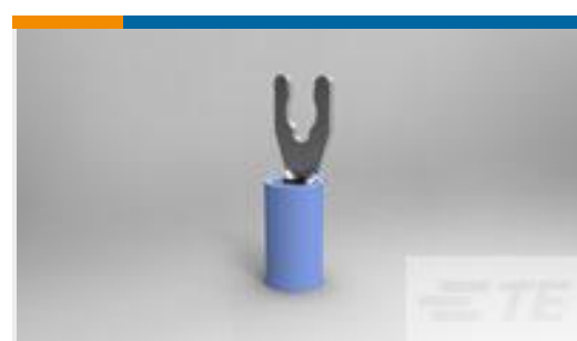
TE Part #52935-1 TERMINAL, PIDG SPR SPD 16-14 6