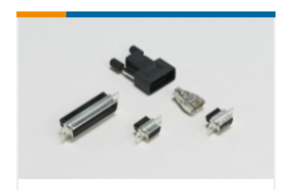
Crimp D-Sub Connectors(10)