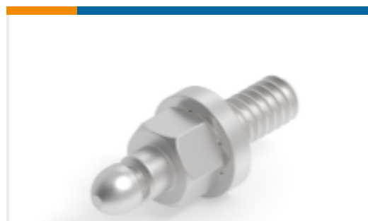
TE Part #1-2308265-5 QL SET FOR VARIANT B 5