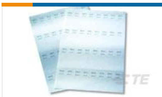
TE Part #187752-000 CR-107-LSR