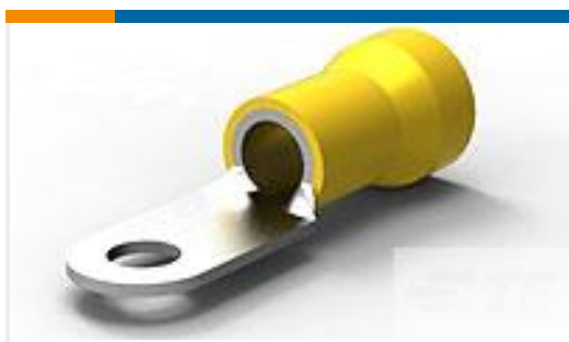
TE Part #52043-1 TERMINAL R PG 4 1/4