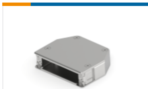
TE Part #1-2308327-1 FULL METAL HOODS SIZE 3 (1)