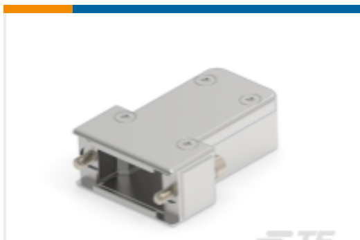
TE Part #1-2308340-1 FULL METAL HOODS SIZE 1