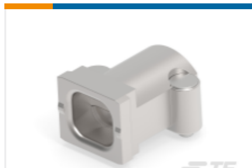
TE Part #1-2308272-1 CABLE CLAMPS (CASE RAW)