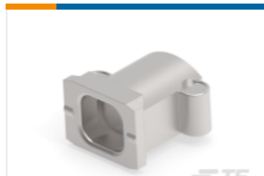
TE Part #1-2308272-6 CABLE CLAMP6 (CASE RAW)