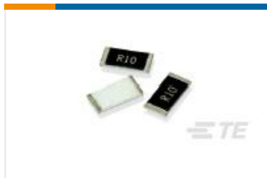
TE Part #2-2176058-7 RLP73K 3A R12 5% 2K RL